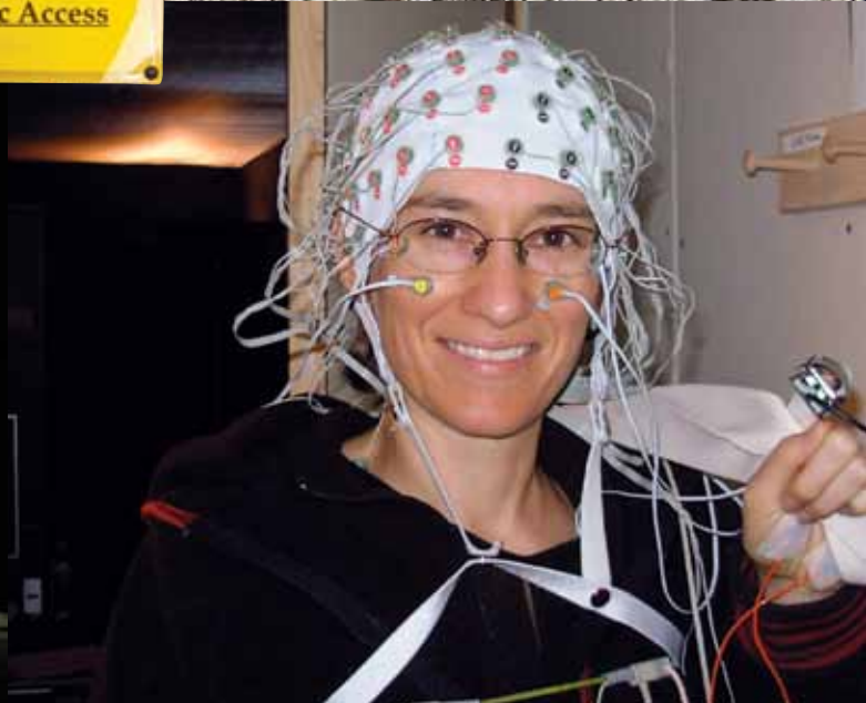
Project participants wear soft skullcaps with electrodes wired to an EEG machine to measure changes in their brain waves. The author is at the far right.