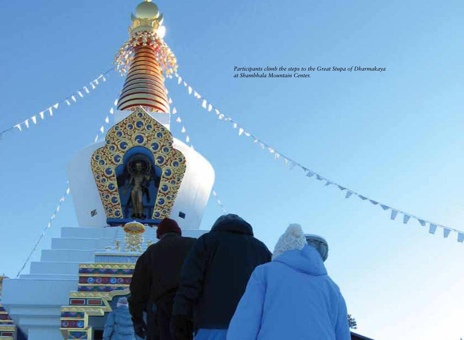
Participants climb the steps to the Great Stupa of Dharmakaya at Shambhala Mountain Center.

particularly for Westerners who are conditioned to think of themselves as separate individuals.